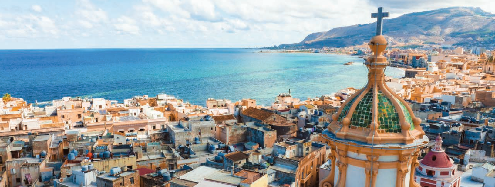
View from Trapani, Sicily, Italy (above) and Tunis, Tunisia (below)