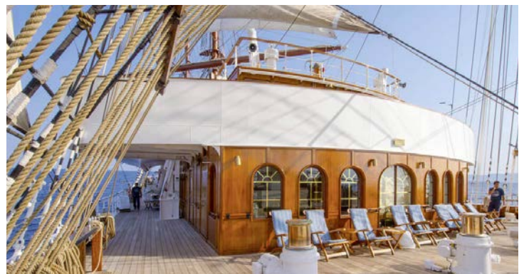
Sea Cloud II Lido Deck

Not Included: International airfare; passport/visa fees; meals not specified; alcoholic beverages other than as noted in inclusions; personal items and expenses; airport transfers other than for those on suggested flights; excess baggage; trip insurance; any other items not specifically mentioned as included.