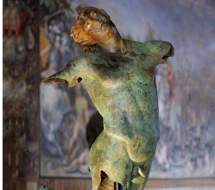
Map of the region (left); The Dancing Satyr, Mazara del Vallo, Italy (right); Carthage, Tunisia (below left) and the Bardo Museum, Tunis, Tunisia (below right)