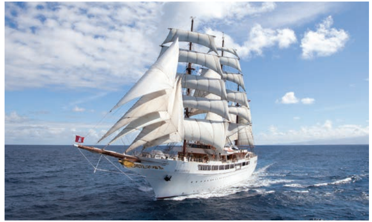
Sea Cloud II

Sea Cloud II is a three-masted sailing yacht steeped in the elegance of yesteryear and complemented with the most modern amenities. Sister ship of the legendary Sea Cloud , Sea Cloud II has 47 outside cabins and travels under 23 billowing sails trimmed by hand. From the mahogany-paneled library and gracious lounge to the gym and watersports platform, no detail has been overlooked. Praised by the world's most discerning travelers, Sea Cloud II receives consistently high rankings from Condé Nast Traveler . Passengers enjoy open seating at all meals and complimentary use of all water sports equipment. A doctor is on call 24 hours a day. Please note: There is no elevator on Sea Cloud II .