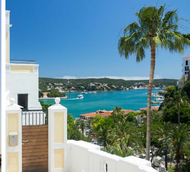
Castello, Cagliari, Sardinia, Italy (left); Mahón, Menorca, Spain (right); Rooftops of Cagliari, Sardinia, Italy (below left) and Talayots, Torre d'en Galmés, Menorca, Spain (below right)